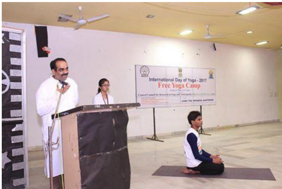
International Day of Yoga 2017