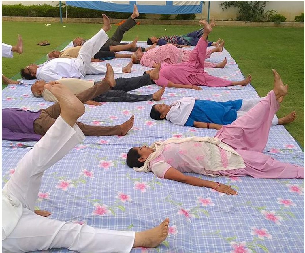
Camp: DISTRICT JAIL MEERUT (FEMALE) (From 05/06/2017 to 21/06/2017).