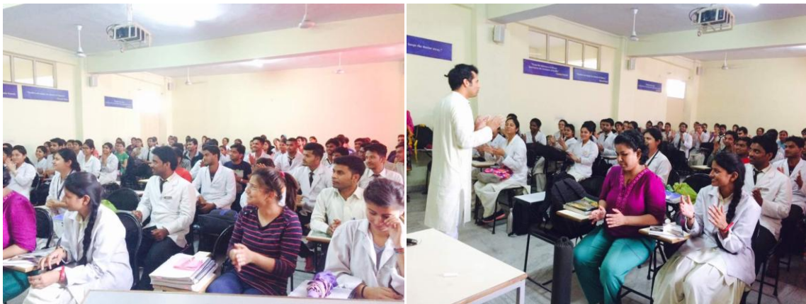
An introductory lecture on Sudarshan Kriya