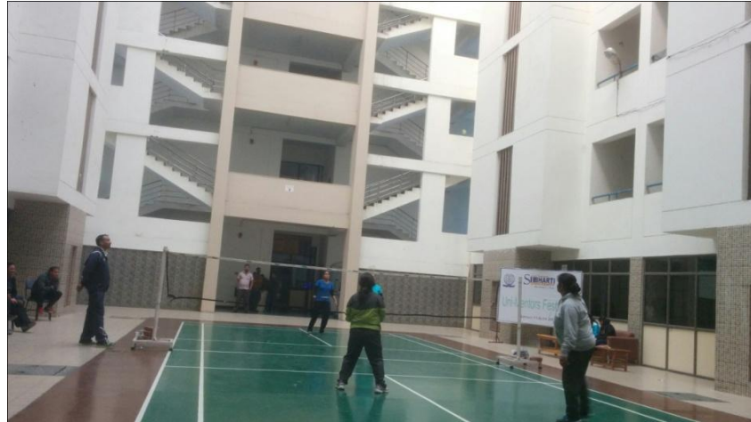
Sports competition “UNI MENTORS FEST-2017”