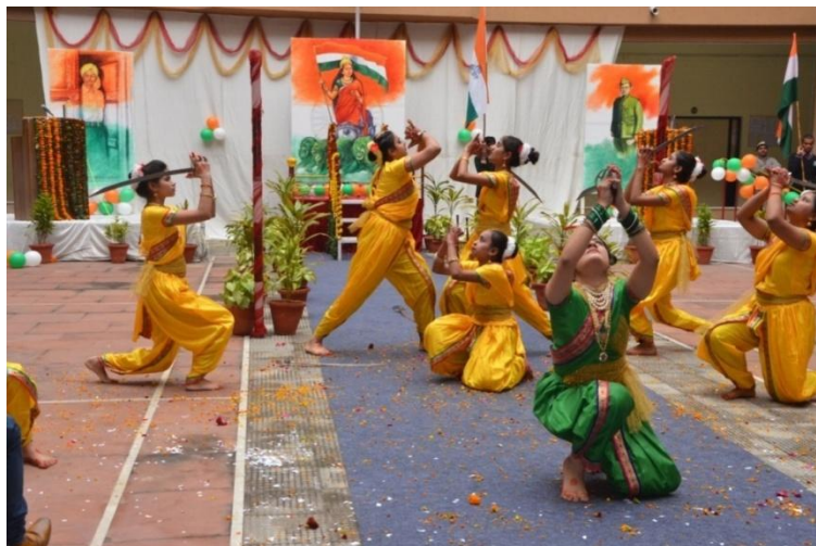
Celebration of 68 th Republic day