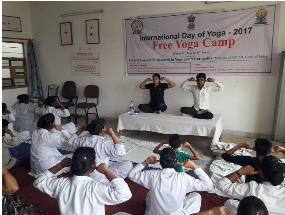
Camp: Rajkiya Mahila Shamalay & Rajkiya Pashchatvarti Dekh Sangathan, Meerut