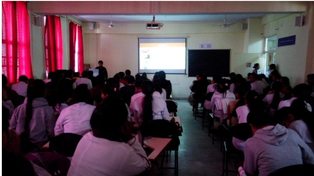
“VITTIYA SAKSHARATA ABHIYAN” (VISAKA)