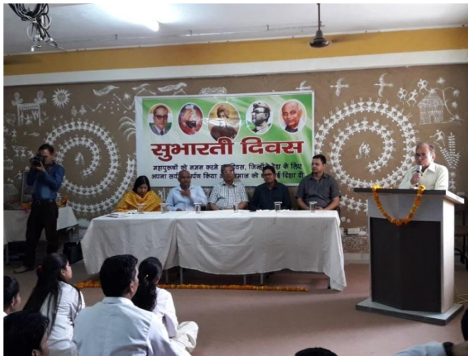
Subharti Day Veer Chhatrasal Jyanti