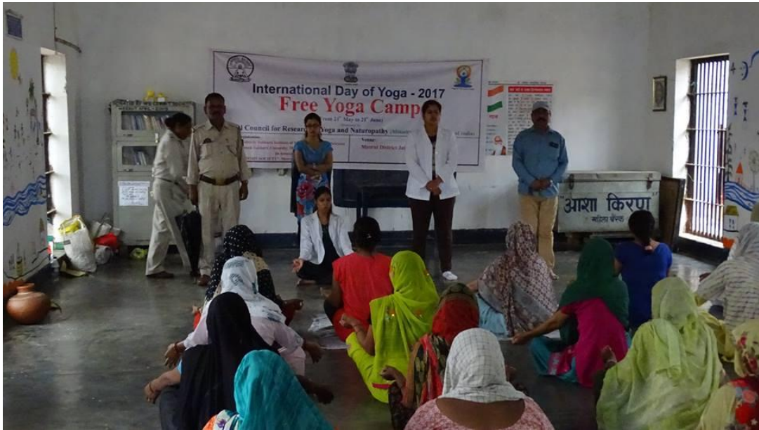
Camp: DISTRICT JAIL MEERUT (MALE) (From 05/06/2017 to 21/06/2017)