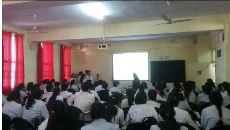
An Awareness program on Self Administration of anti-biotics & their effect