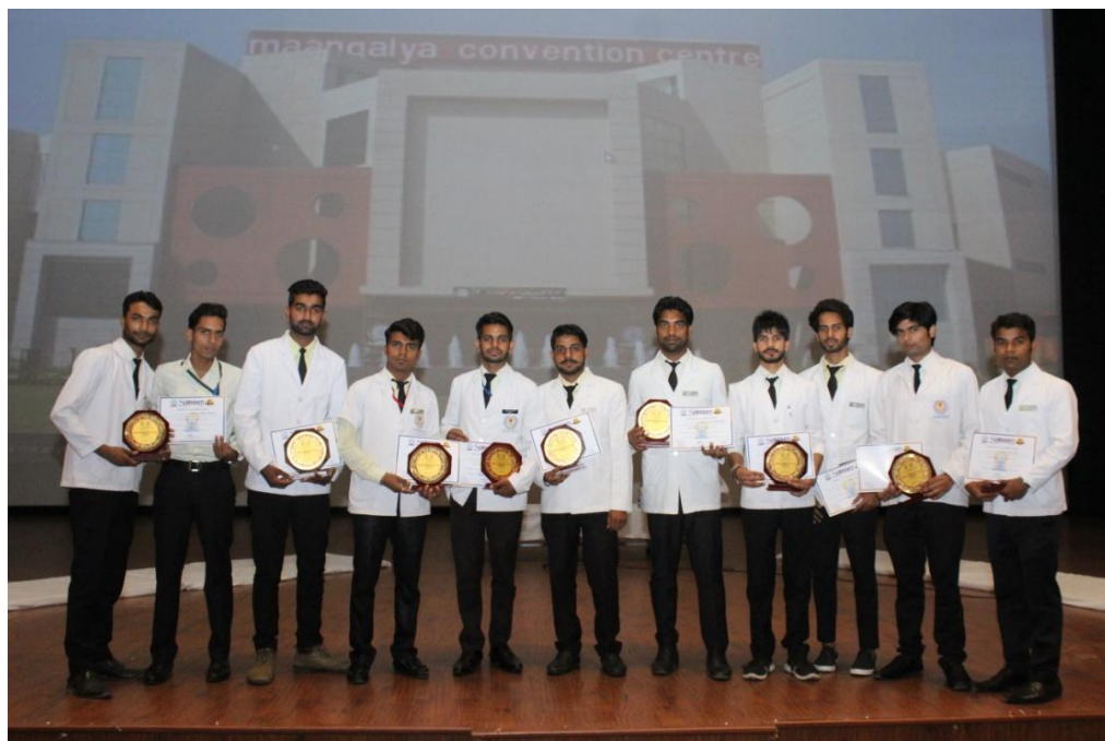
International Day of Yoga was celebrated in our University