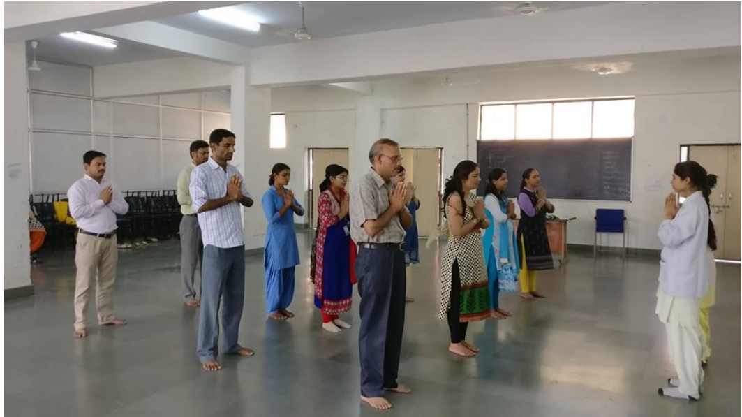
Camp: HOTEL MANAGEMENT AND HOME SCIENCE (From 01/06/2017 to 21/06/2017).