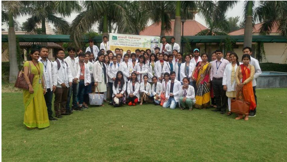
Students of our Institution visited Balaji Nirogadhham, Bhaktawarpur, New Delhi