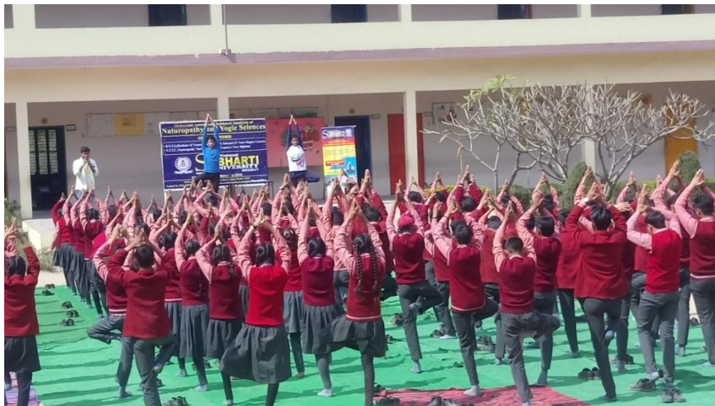
Yoga workshop at New Welkin Public School at Mujhera, Muzaffarnagar