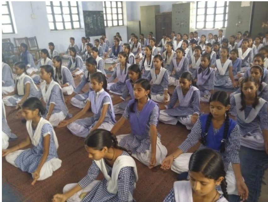
Yoga Workshop at Govt. Girls Inter College, Kila, Meerut