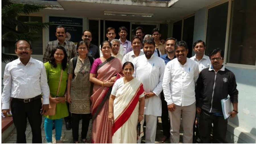
Syllabus Reformation Team in SVYASA Bangalore