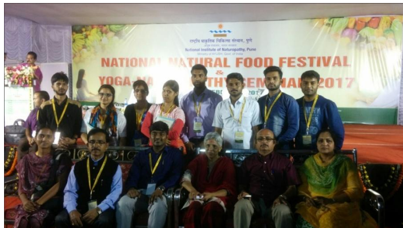
National Natural Food Festival (NNFF)-2017 (Satvik Aahar Mela) & Yoga Naturopathy Seminar at Bhubaneswar, Odissa