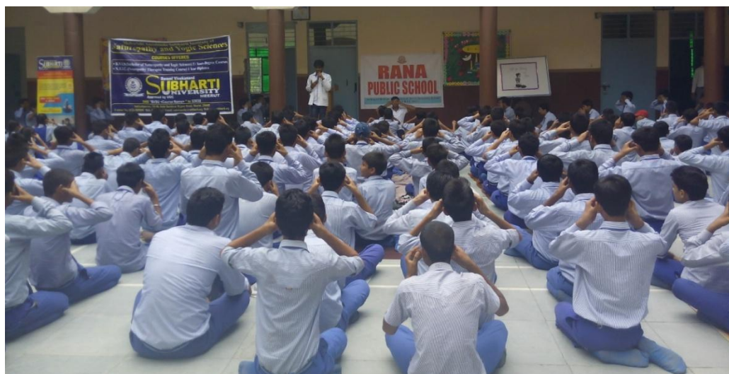
Yoga Workshop at Rana Public School, Muzaffarnagar