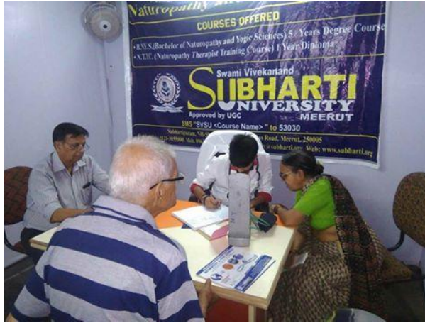
Free Naturopathy & Yoga Consultation/ Treatment Camp at the Famous Nauchandi Mela Grounds, Meerut