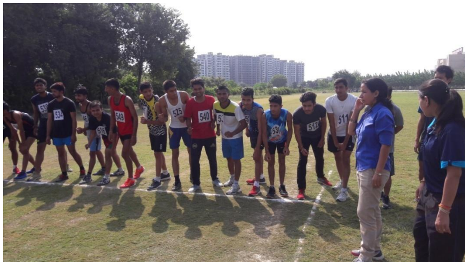
Inter collegiate Cross country Race