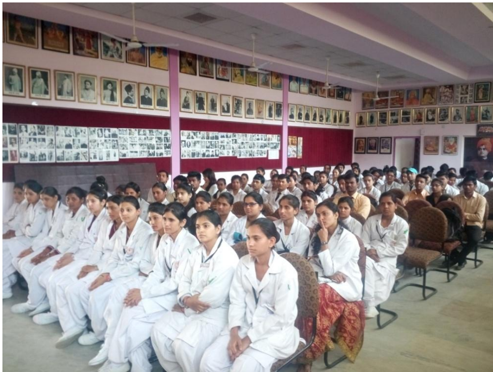
Birth anniversary celebrated of Kalpna Chawla