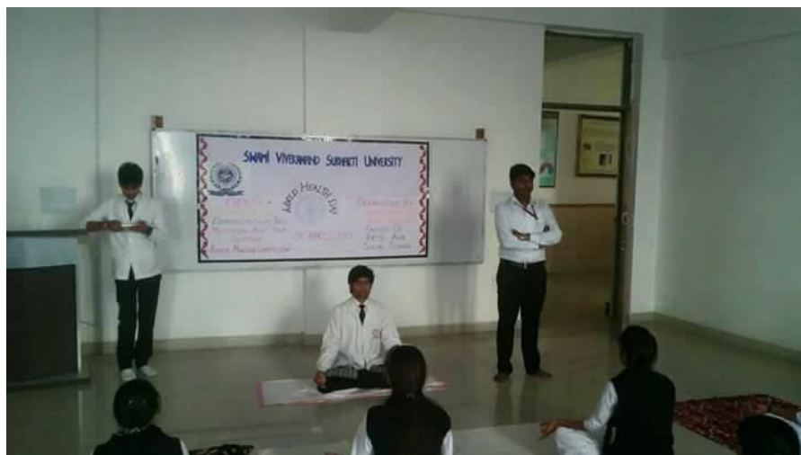
Workshop on WORLD Health day on the topic DEPRESSION let's talk & yoga