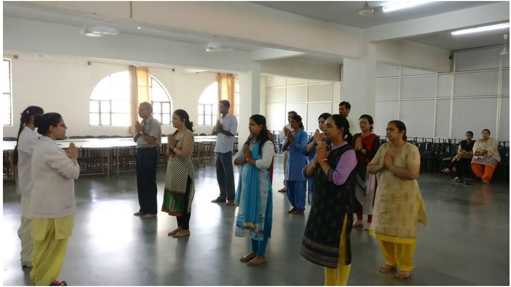
Camp: SUBHARTI INSTITUTE OF TECHNOLOGY & ENGINEERING (From 01/06/2017 to 21/06/2017).