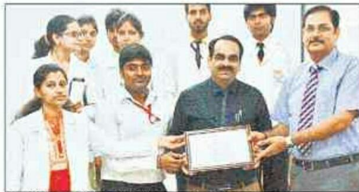
सुभारती डेंटल कॉलेज में मेधावियों को सम्मानित भी किया गया।