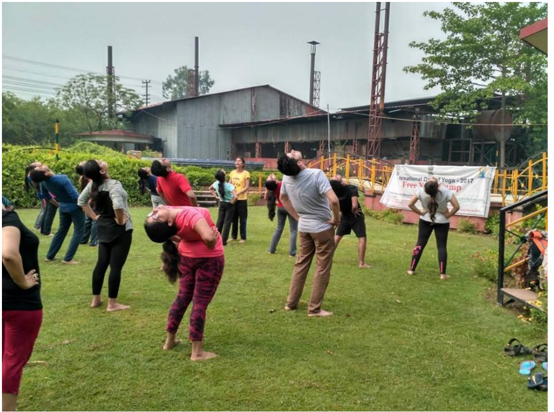
Camp: PAL DHARAMSHALA RITHANI, MEERUT (From 09/06/2017 to 21/06/2017)