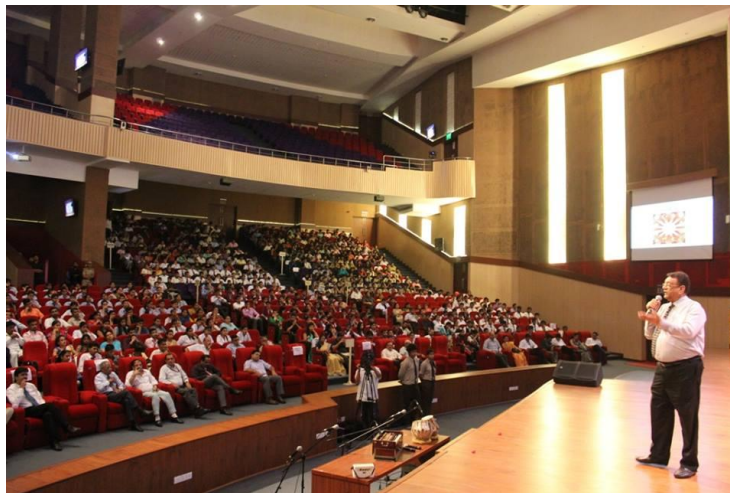
Our staff & all 1 st BNYS Batch 2016 students attended the University Orientation program