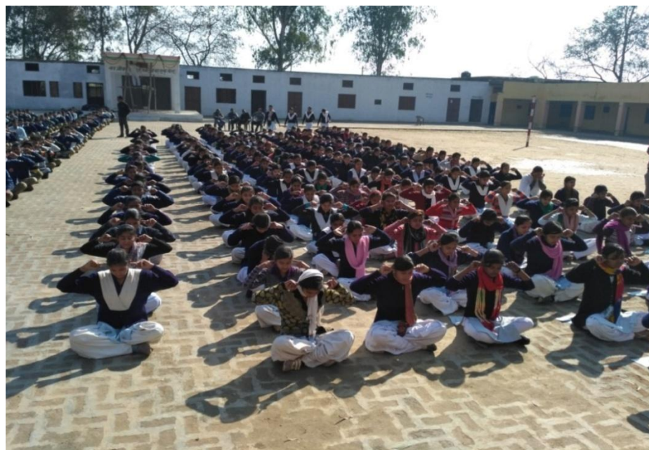
Yoga Workshop at Nav Jeewan Inter College Bhaisuma