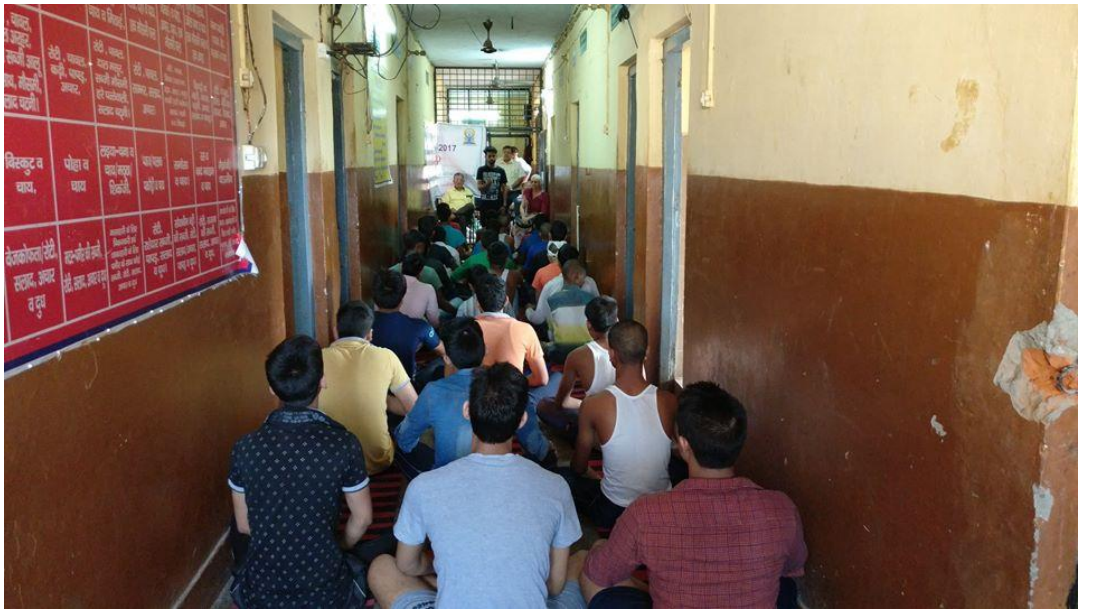
Camp: RAJKIYA SAMPRESHAN GRAH (From 01/06/2017 to 21/06/2017).