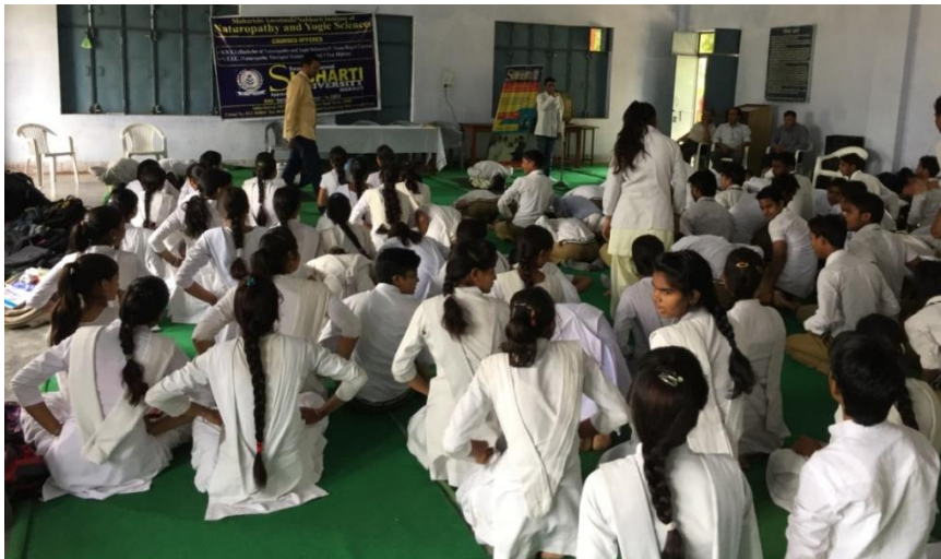
Yoga Workshop at Krishik Inter College, Mawana, Meerut