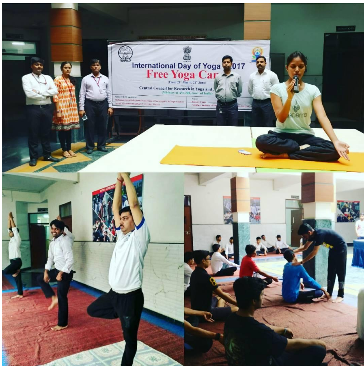
Yoga camp on account of International Day of Yoga for 15 days started in Bhikaji Cama Subharti Institute of Hotel Management