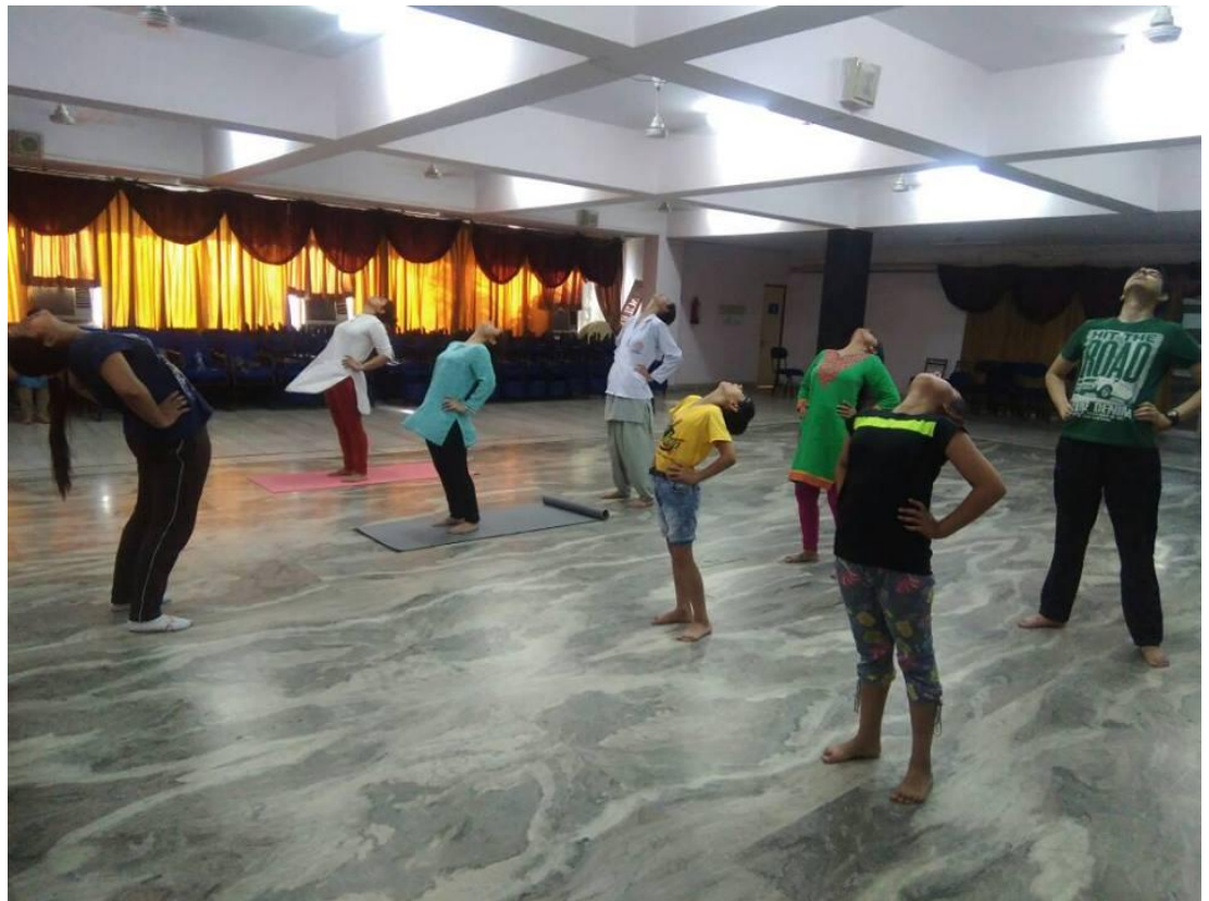
Camp: SUBHARTI DENTAL COLLEGE (From 05/06/2017 to 21/06/2017)