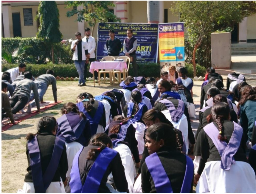
Yoga workshop at Marwar Inter College, Pilkhawa