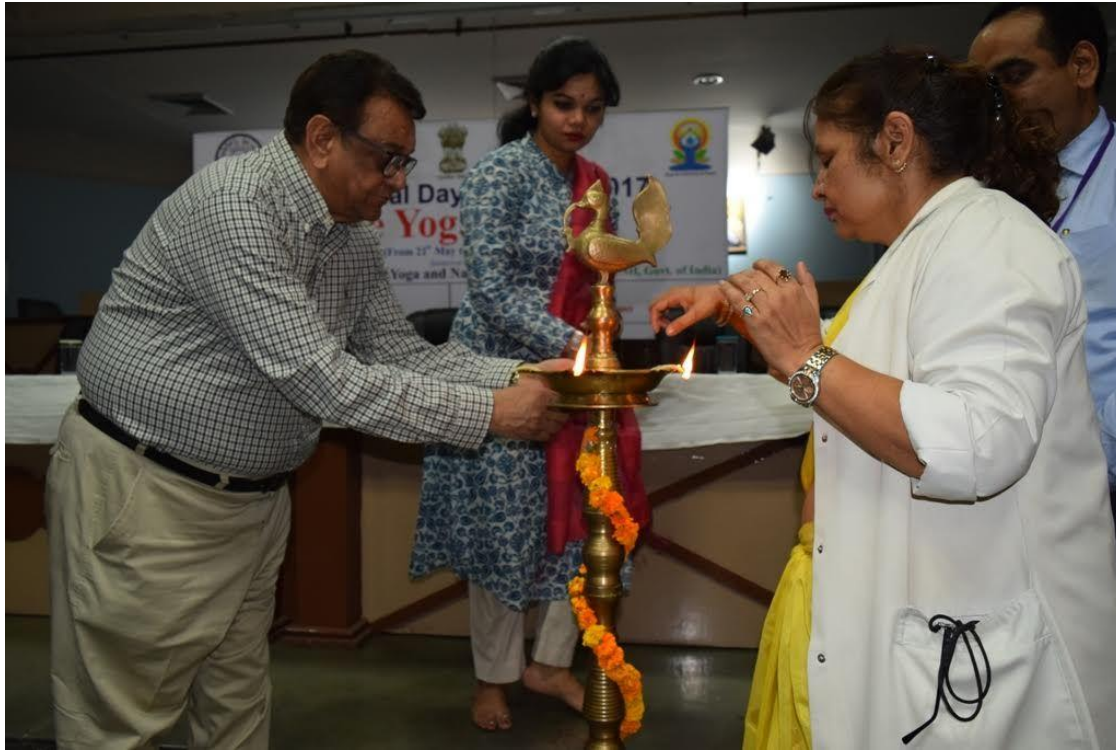
The formal Inauguration of International Day of Yoga (IDY) – 2017