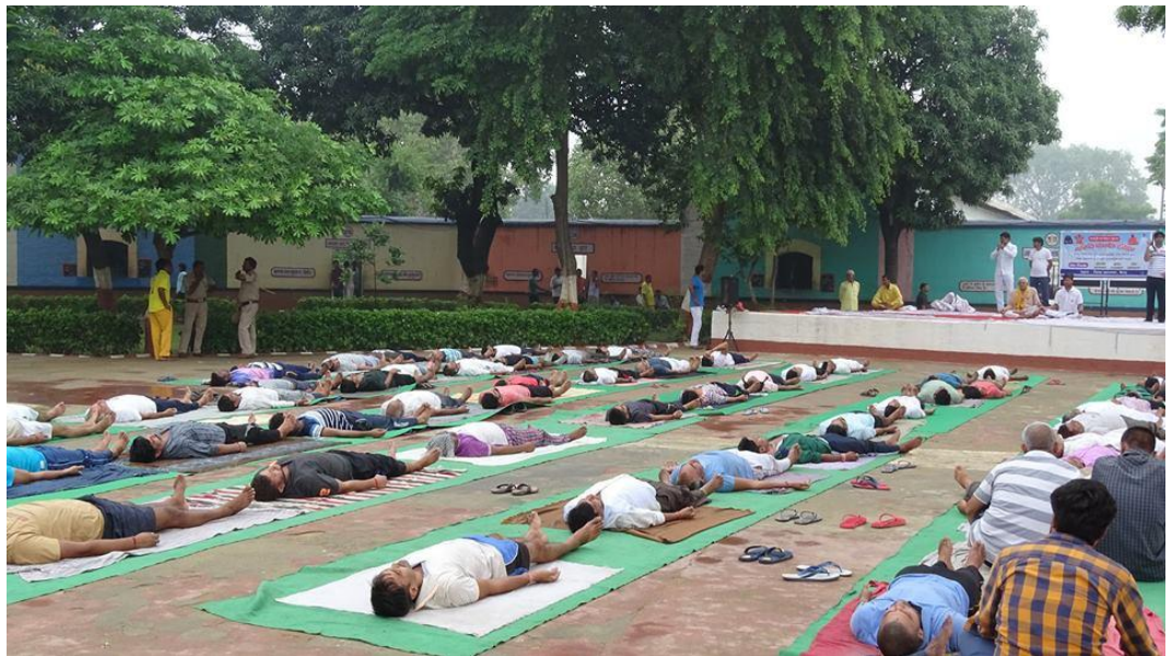
International Day of Yoga Celebrations IN MEERUT CENTRAL JAIL ON 21ST JUNE 2017 at 2:00 pm to 5:00 pm