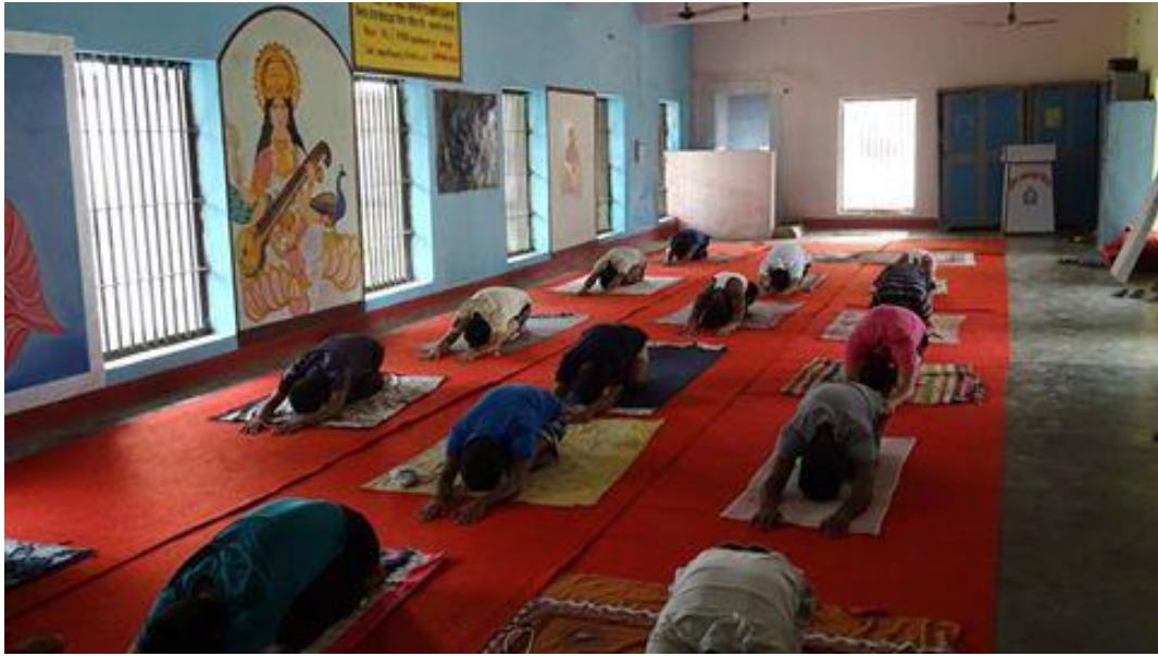
Camp: SUBHARTI MEDICAL COLLEGE (From 05/06/2017 to 21/06/2017)