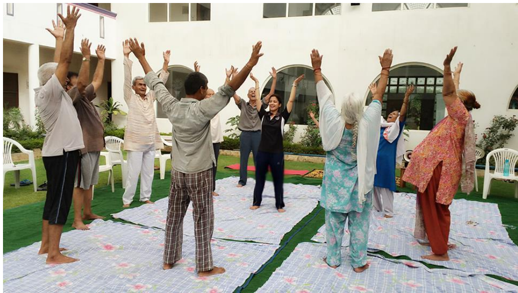
Camp: ABHA MANAV MANDIR