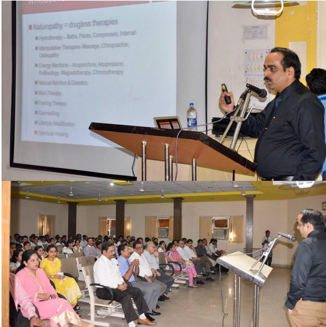
Guest lecture on “Lifestyle Modification for better health through naturopathy & yoga”