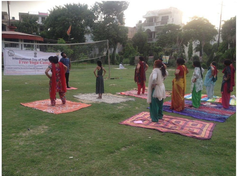
Camp: SHAHID BHAGAT SINGH SUBHARTI URBAN HEALTH CENTER MULTAN NAGAR (From 19/06/2017 to 21/06/2017)