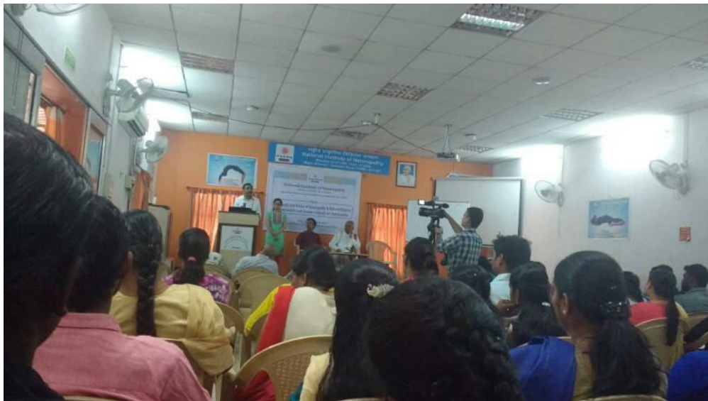
CME on Philosophy and basis of Naturopathy & Natural Hygiene at National Institute of Naturopathy (NIN), Pune