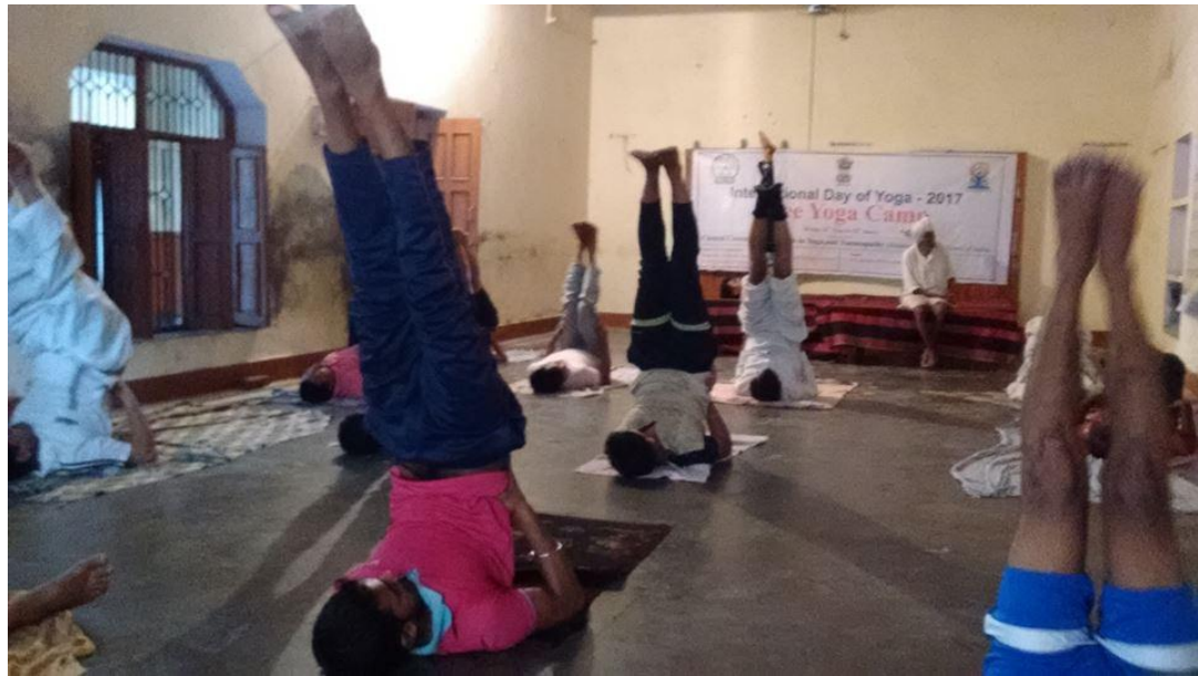
Camp: VED VYAS PURI PARK (From 12/06/2017 to 21/06/2017)