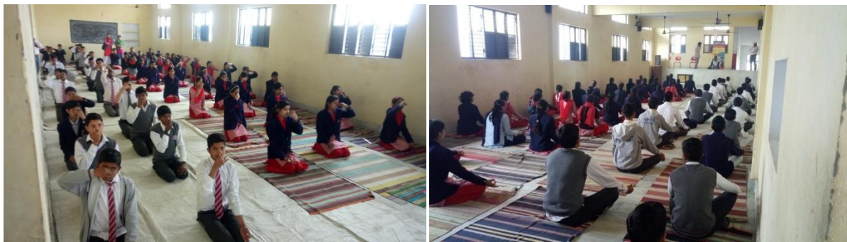
Yoga workshop at Arya Academy Inter College, Muzaffarnagar