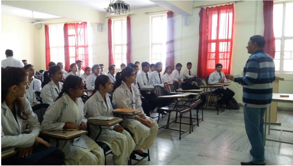
Guest lecture on scope & recent developments in the field of Naturopathy & Yoga