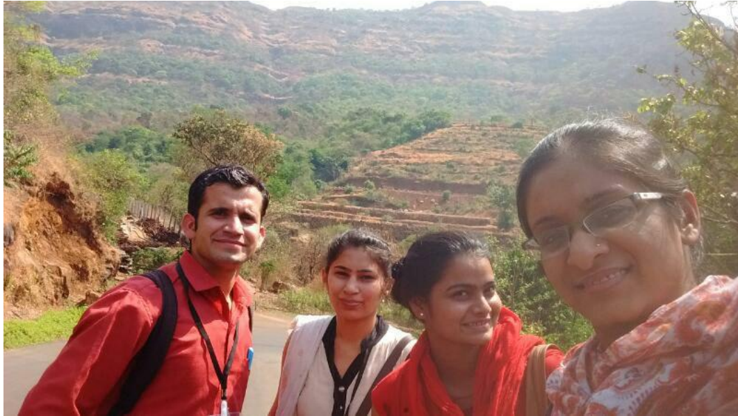
Our interns visited one of India's best Health Destination Atmanan Pune