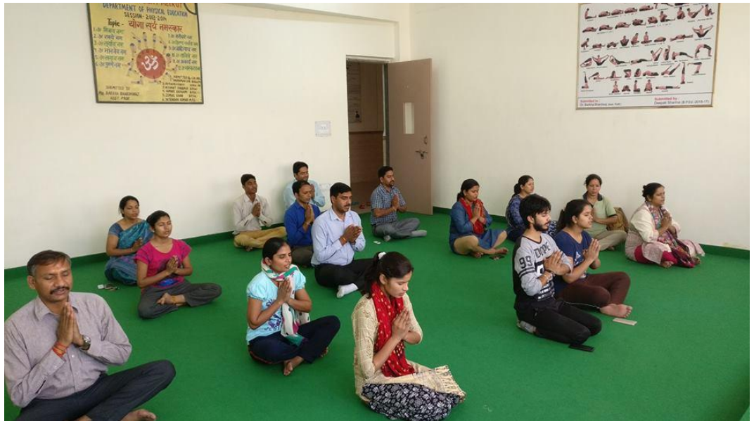
Camp: PHYSICAL EDUCATION (From 02/06/2017 to 21/06/2017)