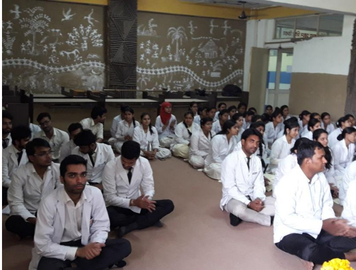
An orientation lecture & demonstration on naturopathy & yoga