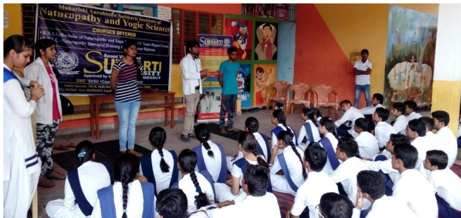
Yoga Workshop at Vidya Mandir Inter College, Shastri Nagar Meerut