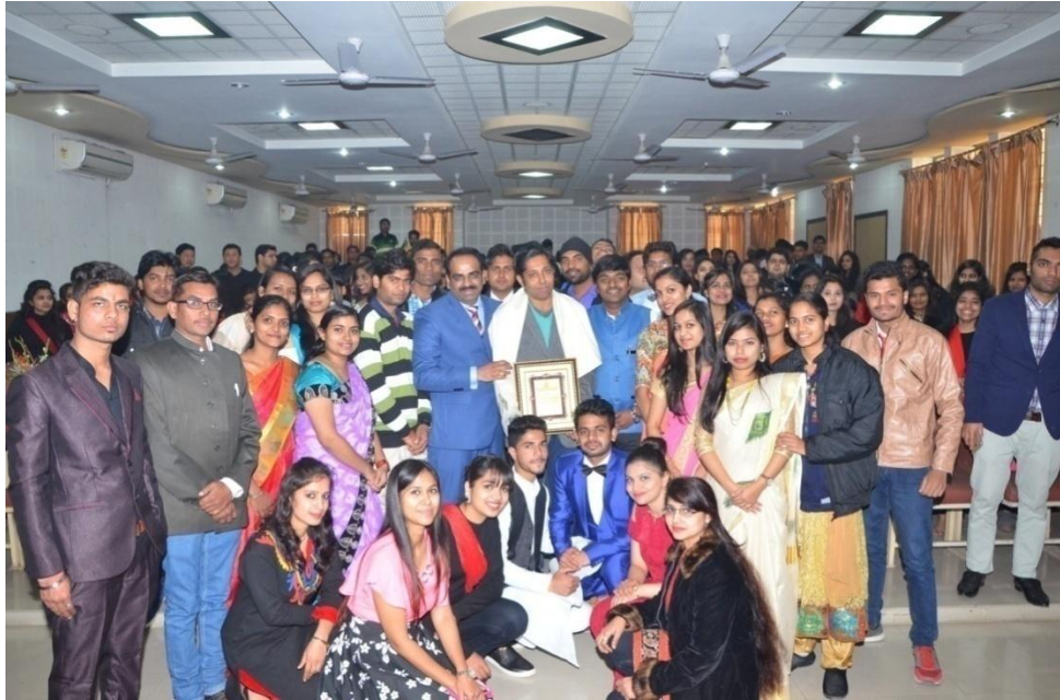
“ANNUAL CULTURAL FEST 2016-17”